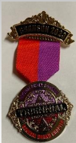
Figure 1 A. Jewel