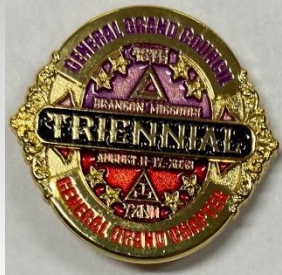
Figure 2 B. Lapel Pin