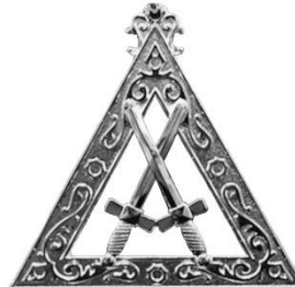
Royal Arch Captain