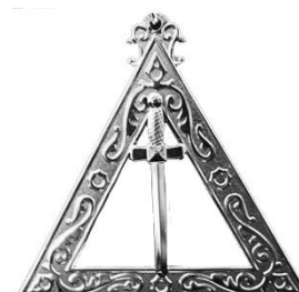
Master First Veil