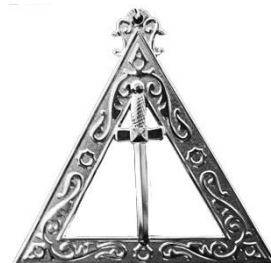
Master Second Veil