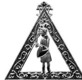
Captain of the Host