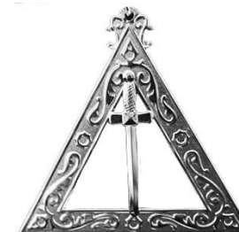
Master Third Veil